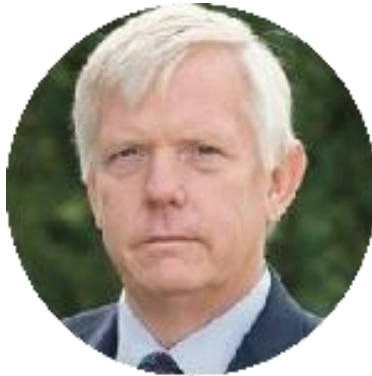
David Fothergill Leader Somerset County Council Twitter: @DJAFothergill